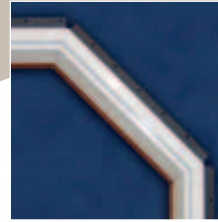
45° Clipped Corner