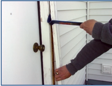
1. Remove wood brickmould.

Installation Videos On Line at www.frontlinebldg.com