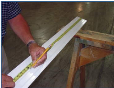
2. Measure door jamb & transfer dimensions to cladding.