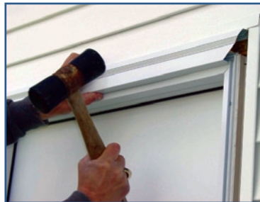
5. Snap on the new brickmould.