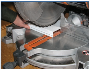
3. Cut jamb cover & brickmould.

ONE 45° CORNER CUT NEEDED FOR ENTRY DOOR FRAMES AND SINGLE GARAGE DOOR FRAMES