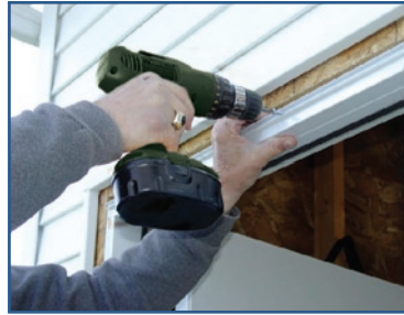
4. Screw jamb covers to the jambs.

NONE NEEDED FOR DOUBLE GARAGE DOOR FRAMES